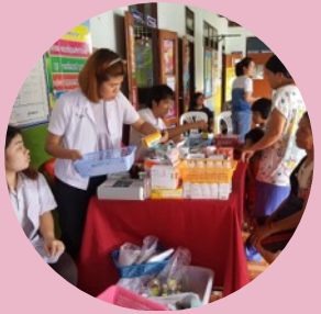
Provided Community Health Check up