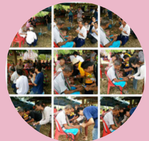
Ask for blessing from elders in Songkran Festival