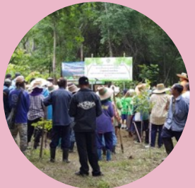
Supported forestation of local community